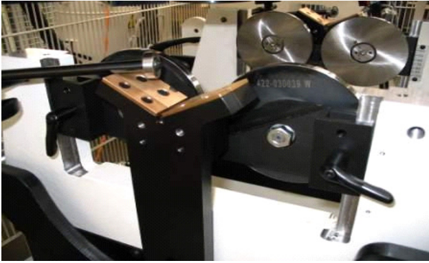
Measuring rollers and lifter