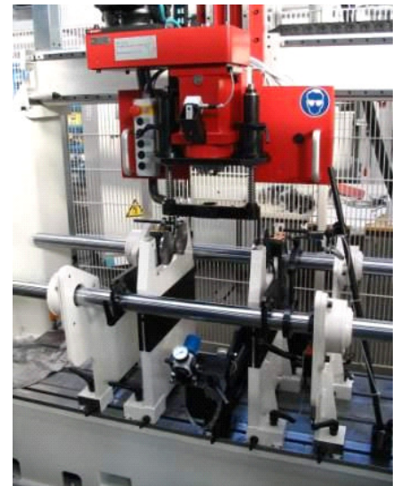
Drill unit with chip suction

Without obligation, subject to change without notice!